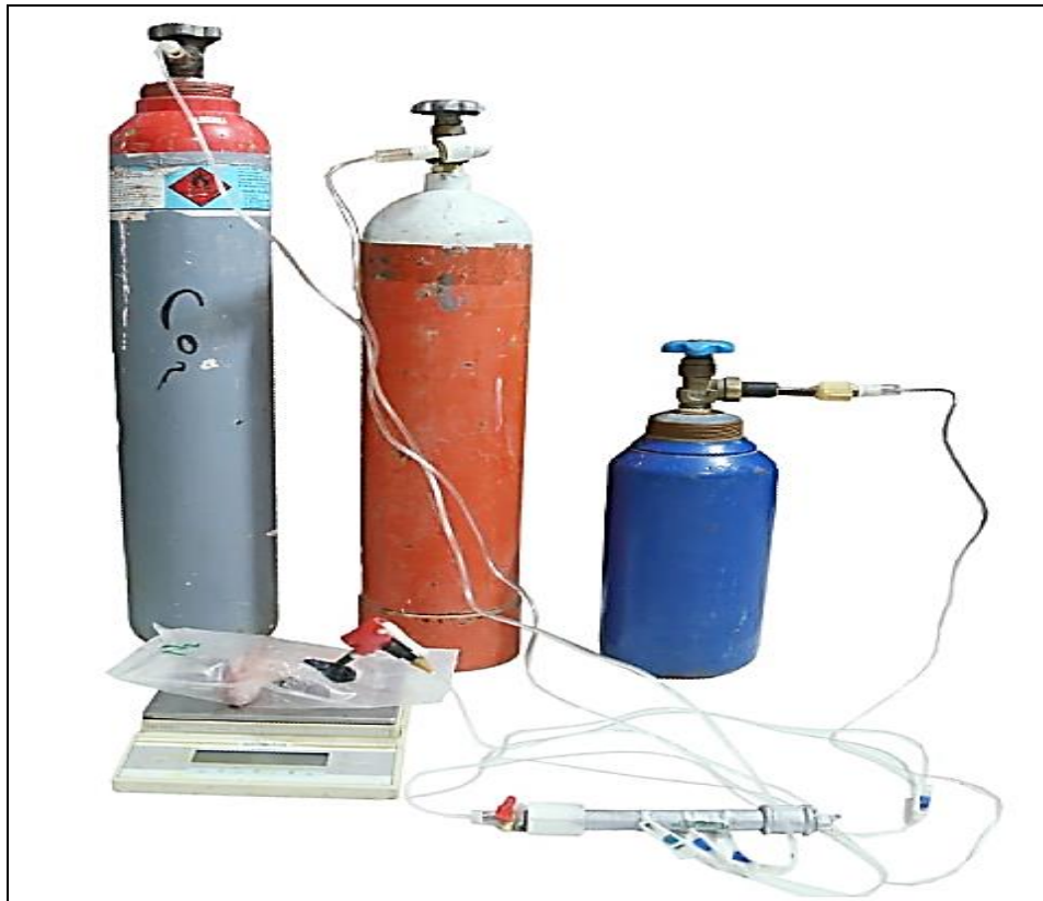
Fig. (2): Photo of the gas pumping system in meat bags.