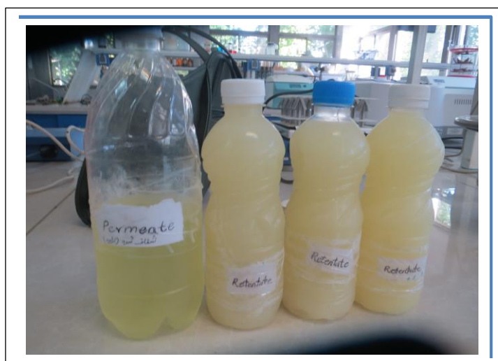
Fig. (3): Whey proteins concentrate (Retentate) and permeate.

This difference in the ratio of protein may attribute to the concentration of the proteins in