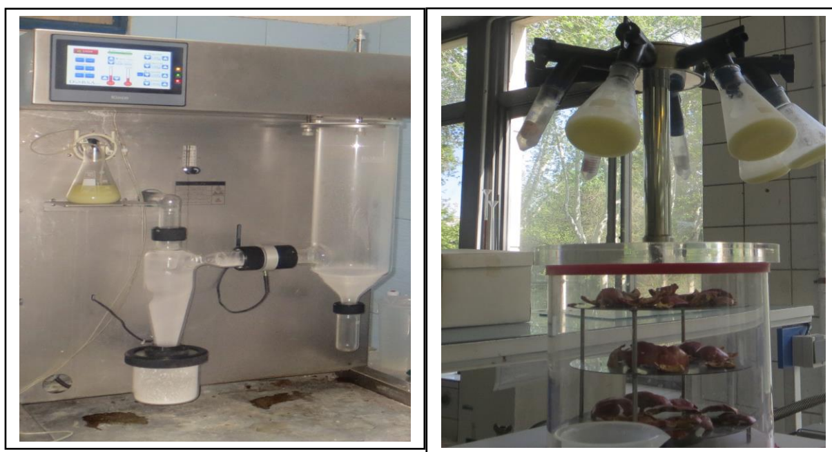
Fig. (4): Spray drier and Freeze-drying (Experimental Dairy, Dairy Science College, Tehran).

enzymatic and dried with spray-drying are better than bovine whey protein. The spray-drying technique requires good adjustment for work conditions and also appropriate for solutions contain active components. The most important factors of succeeding in the drying process are the log on/off temperature, the ratio of spray, pressure average and the concentration of solid material (Gallo et al. , 2011; Santana et al. , 2018).