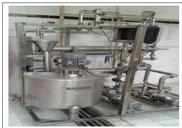
Fig. (1): The Ultrafiltration plant (Experimental Dairy, Dairy Science College, Tehran)

taking into consideration the work conditions (a type of sample) upon running and operating the device. The method in which described by Lorenzen & Schrader (2006) has been adopted.as in the table (1).