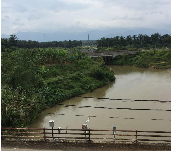
Fig. (1): The landscape of KRB including the streamflow sensor (photo taken on August 4, 2017).

for a four years period 1991-1994 and a 1 year period 1998. Fig. 1 is a photo showing