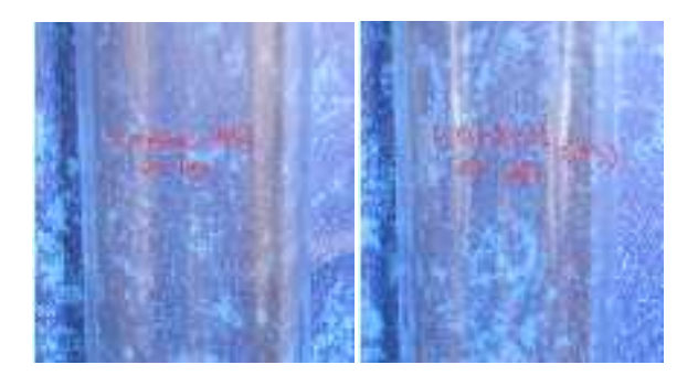
Plate (1): Initial callus growth of MS control (left) and media after incubation periods of 30 and 60 days (right).